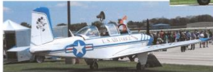
Facebook: Warbirds Squadron #32 Ready Room, Phone: 920-385-9334 E-mail: WarbirdsSquadron32@gmail.com

Our friends at Warbirds Squadron 32 here at Oshkosh are holding their Drive-In/Fly-In Pancake Breakfast at the Wittman Regional Airport Saturday, June 10. This is also International Young Eagles day and Chapter 252 will be flying Young Eagles at this event. Come on out for pancakes and airplanes!