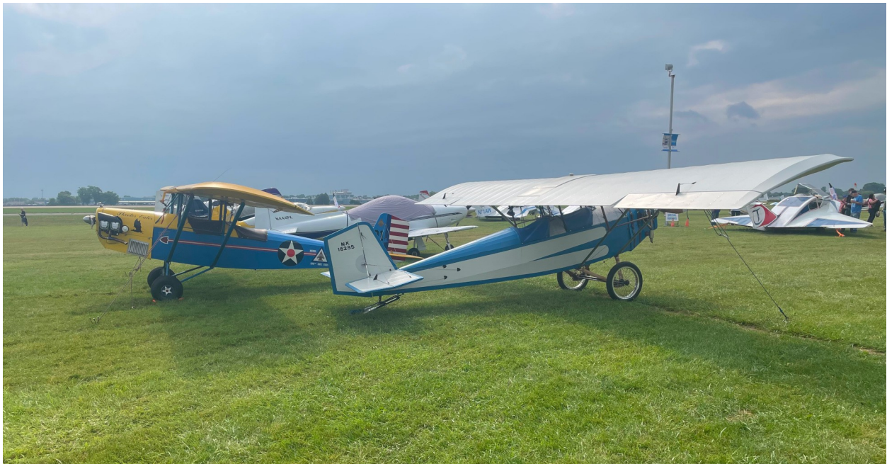
Greg Cardinal and Bob Poore's Pietenpol's at OSH.

Our chapter was assigned a camping area that was farther away than past years. Our course, like typical pilots, we complained about it for the first day, or two, but after walking to the show entrance or riding a bike, we realized none of us were going to die traversing the added distance. As a matter of fact, it did me good to walk the extra distance, especially after an afternoon A & W root-beer float.