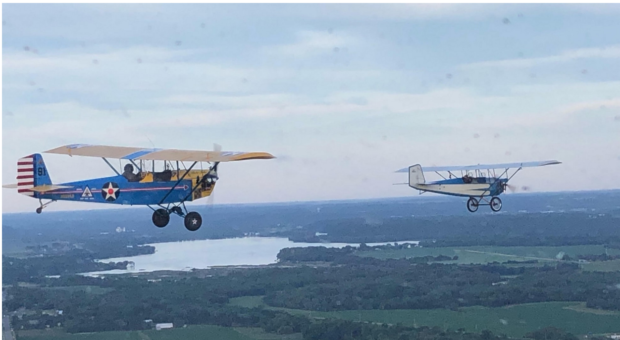
Mike York piloting photo ship Zenith 701