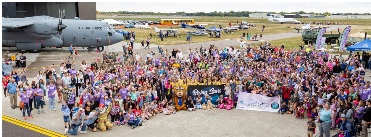
Girls in Aviation 2023

Questions about the event? Please reach out at BOD@starsofthenorth.org