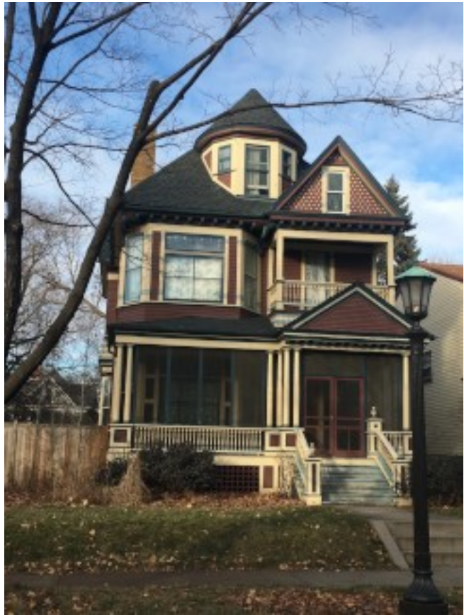
House where Earharts lived on Fairmount Avenue

Amelia lived in St. Paul from spring 1913 to spring 1914. She attended St. Paul's new 1912 Central High School.