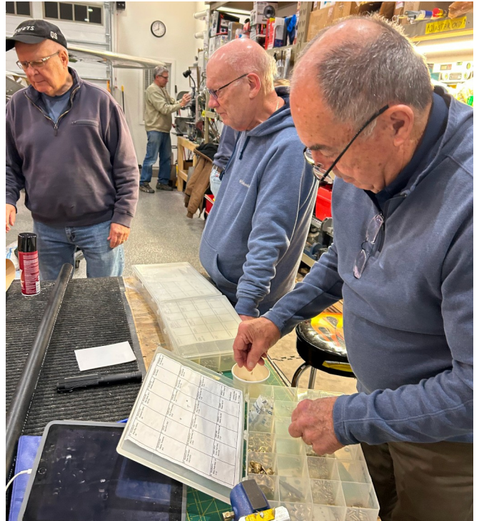
Selecting correct rivets for completing the flaps