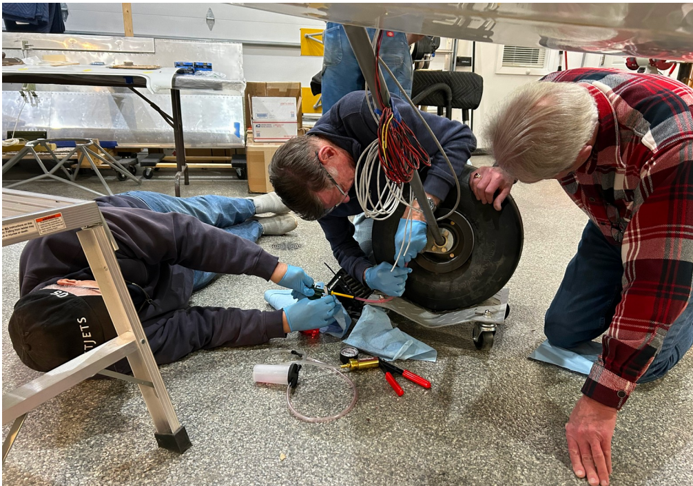
Bleeding the brake's hydraulic lines