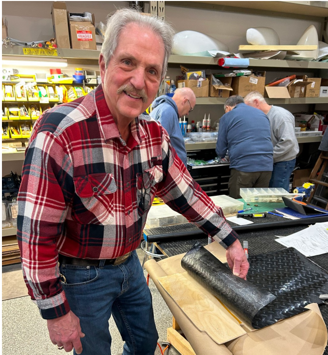
Glueing non-skid covering on floor panels