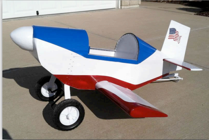
RV Pedal Plane

The pedal plane project is coming along well and all the material has been procured. We are starting construction of the model and welcome all hands to come out and help build this pedal plane. All the plans are in the Chapter Lounge and the material is in the hangar. Even if it is just popping a rivet please do come out on Sundays and encourage fellow members that are participating.