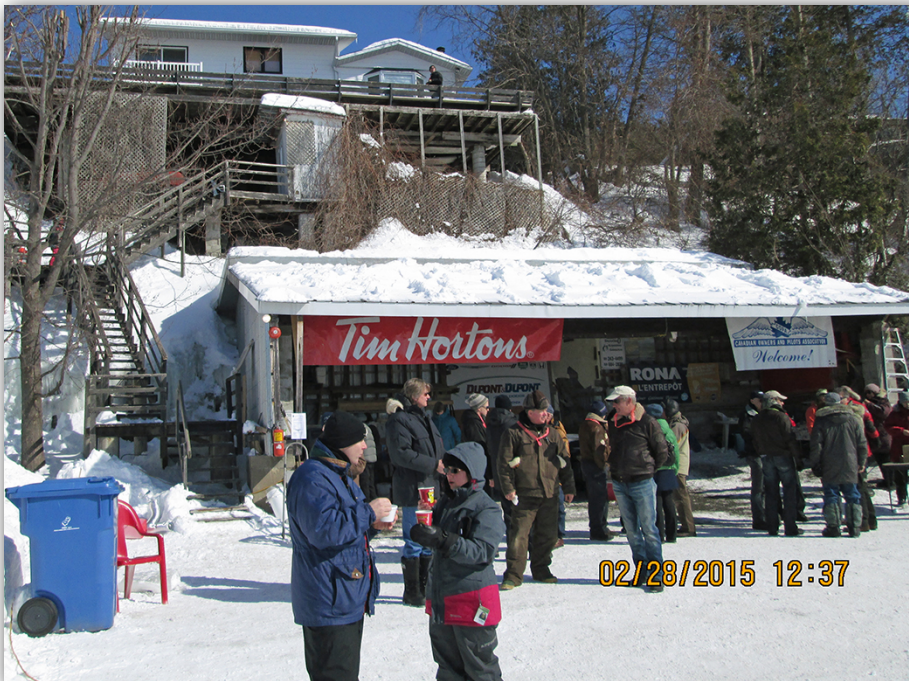
The Food Stand

A great variety of ultralights, home built and certified aircraft could be seen along with 3 helicopters as far away as Smiths Falls. The scope of the entire operation was astounding with an improvised control tower, ground handlers, food and beverage services and presents for pilots. Mo was seen greeting the arrivals and bidding them welcome.