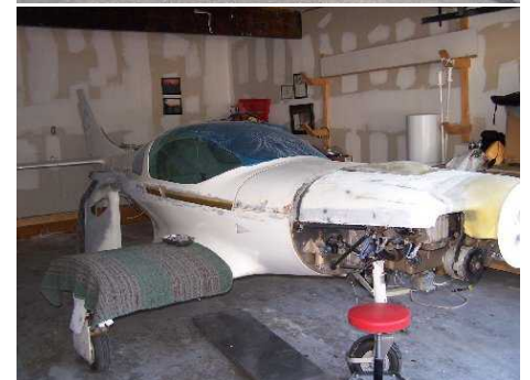
SAFE AT THE NEW WORKSHOP