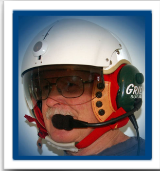
35 YEARS AGO June 1978