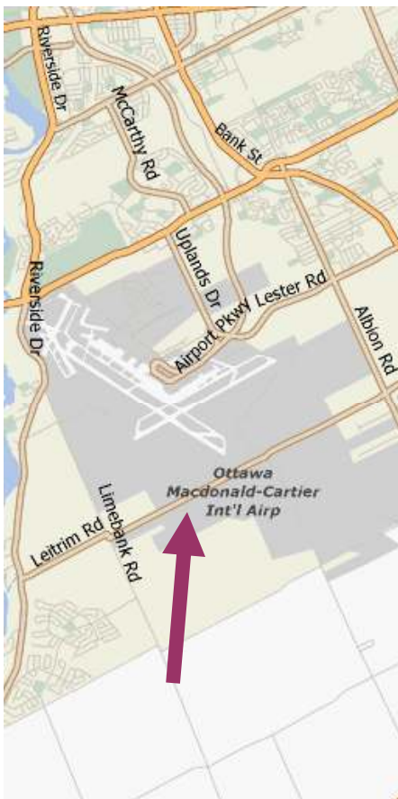
MAP 1Map to NAV Canada Control Tower at the Ottawa Airport. The arrow