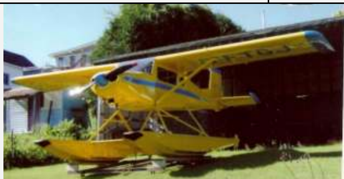
1996 Murphy Rebel- 590 TTSN- 125 SMOH- 0-320E2D- 150HP. New cylinders, New paint in

2006. PERFORMER; 1092 lbs empty - on 1800 floats. Prince Prop, VFR I-com A200 Call 11/07 Denis (613-673-9283)