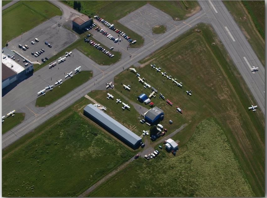
Last years Chapter 245 Fly-In

In addition to the multitude of visiting planes and displays, Pilots N Paws will be on hand to answer questions about their awesome animal rescue program and the Ottawa Fire Service Carp station will have a pumper and firefighters on hand for educational purposes. Young Eagle flights are again being