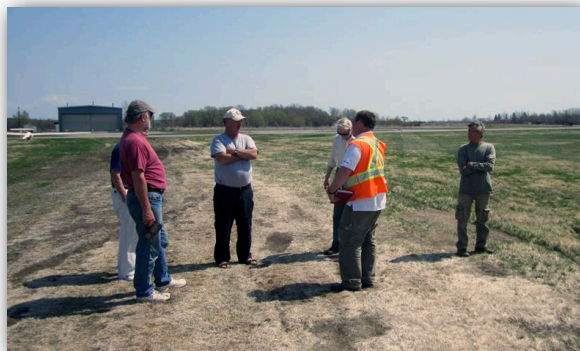
Chapter members discussing new grass strip with Carp Airport Manager

New to the Fly-In this year will be a grass strip. Yes, that's right; Carp Airport has agreed to the development of a grass strip which will parallel runway 28 – 10 on the north side. Our Chapter members have been assisting the Airport to groom this strip in time for the fly-in.