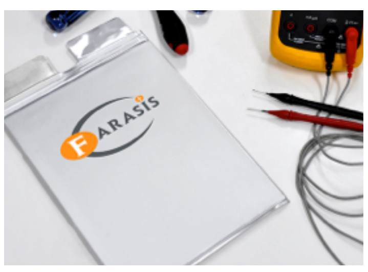
3.65 volt Individual battery cell pouch for 102 volt packs