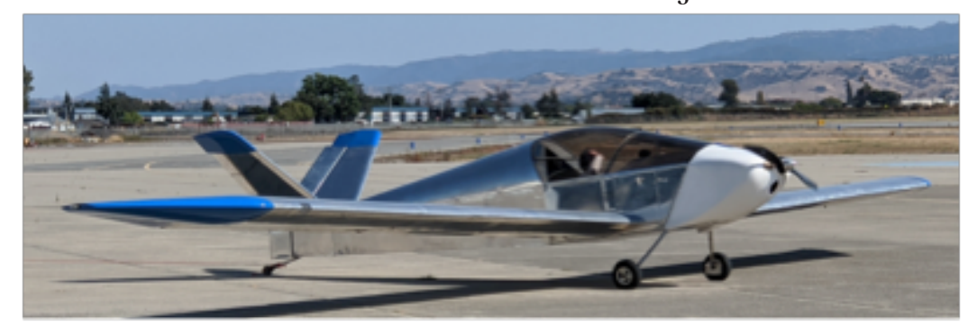
built by Gabe Devault