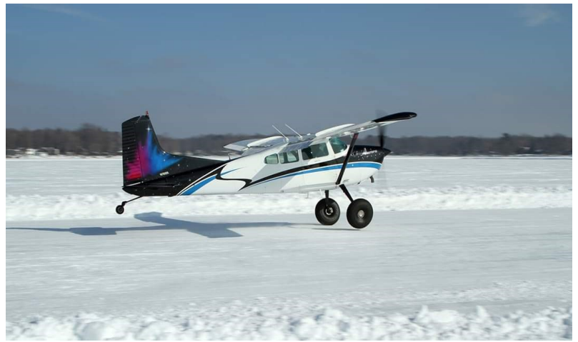
Emily Deblack nice 180

Good morning. As of the end of March I am retiring from 30 yrs. One of the activities or on my bucket list is to assist in building a airplane. I am the most interested in Velocity and personal class of home built. It does not look like that type of project is one on the chapter agenda. If its is, my mistake. If it is not one of the projects would you please forward my name and contact information to someone who is and would like some assistance on such a project. Now for open disclosure I am handy but have not done such a project.