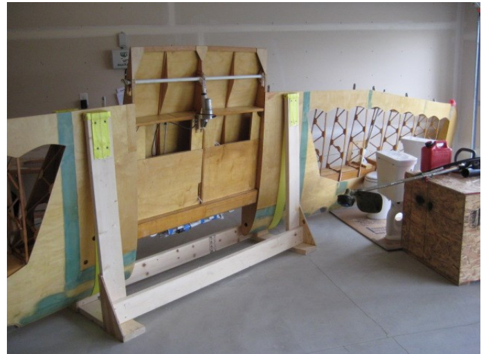
The Emeraude Project