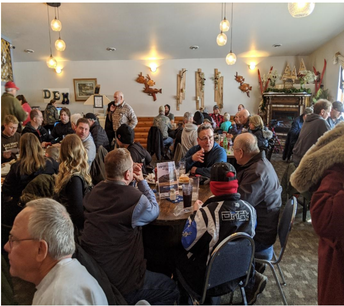
Part of the group at awards time.