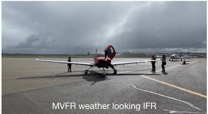
MVFR weather looking IFR