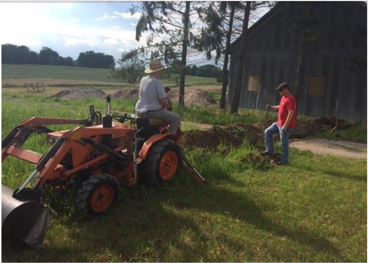
Bringing power and water to the barn