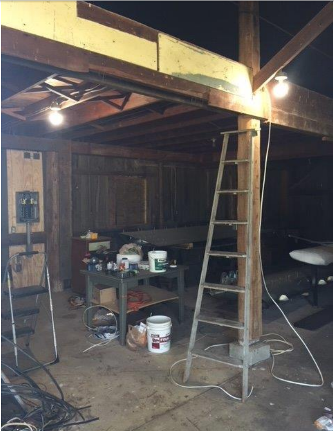
The beginning ...