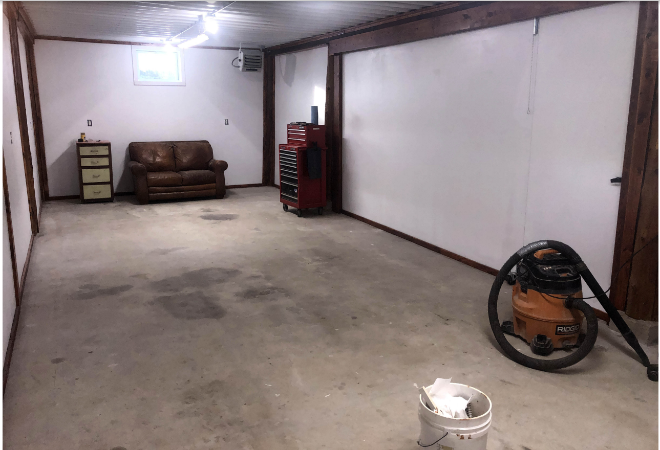
Our Build area in the barn, ready for projects ....