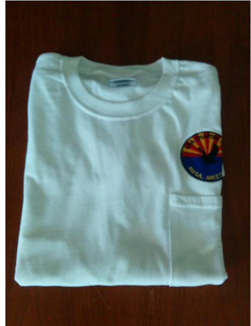
PHOTO OF POLO SHIRTS AVAILABLE

Cost $25 for the grey and $15 for the white.