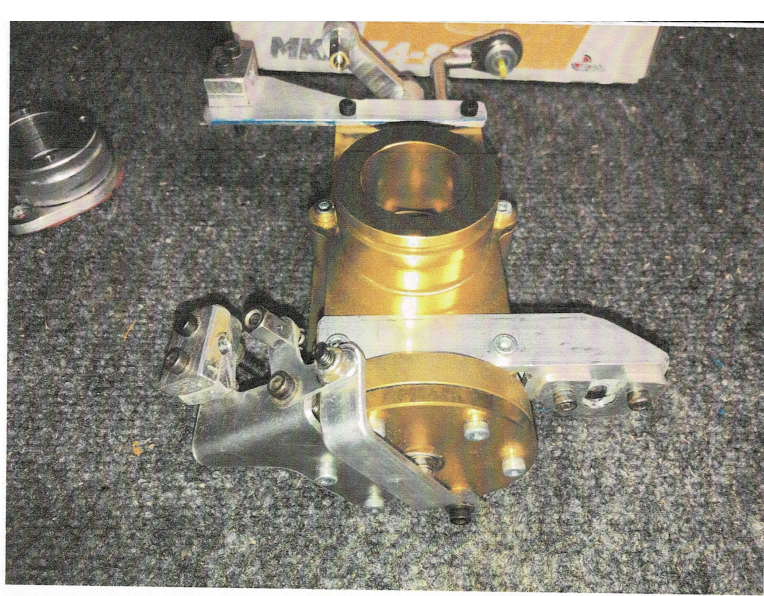
The above Throttle Body Injector is a Rotec TBI MK.II 34-S unit that lists for $910. Will sell for $500