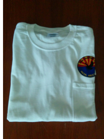
PHOTO OF POLO SHIRTS AVAILABLE

Cost $25 for the grey and $15 for the white.