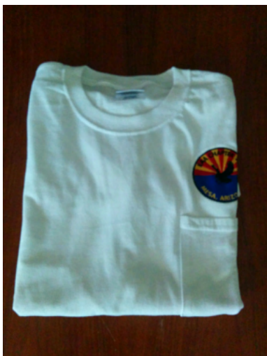
PHOTO OF POLO SHIRTS AVAILABLE

Cost $25 for the grey and $15 for the white.