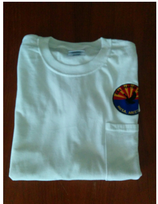
PHOTO OF POLO SHIRTS AVAILABLE

The City of Casa Grande has refurbishing the food service area in their Airport terminal area and are having to get all the change permits approved before they can start issuing a requests for quote for someone to provide food handling services. Hopefully the Casa Grande Airport will soon again have a fly in breakfast available.