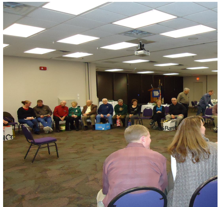
Getting ready to open gifts