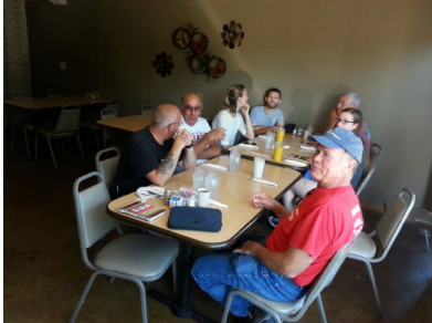
Good time at Sully. All went well.