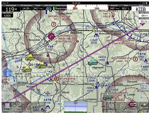
Another SUPER day at Lone Rock. 13 of us. All went well. Makes lots of traffic on my ADS-B system. Bought a new iPad Pro which you can see better in bright sun light. Screen shots are to show more detail of entire area with all the traffic.