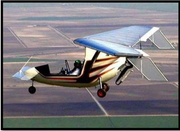
The photo is an example of the airplane that is for sale.

F or sale by third owner family. Falcon Ultralight plus trailer. Last flown in the year 2000. Only sold as complete parts plane. $4,500.00. Always hangared or garaged. Ballistic parachute. Custom windscreen cover. UP kit for rudders. NEVER DAMAGED. ✈