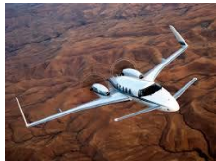
The Famous Beech 17 Starship!