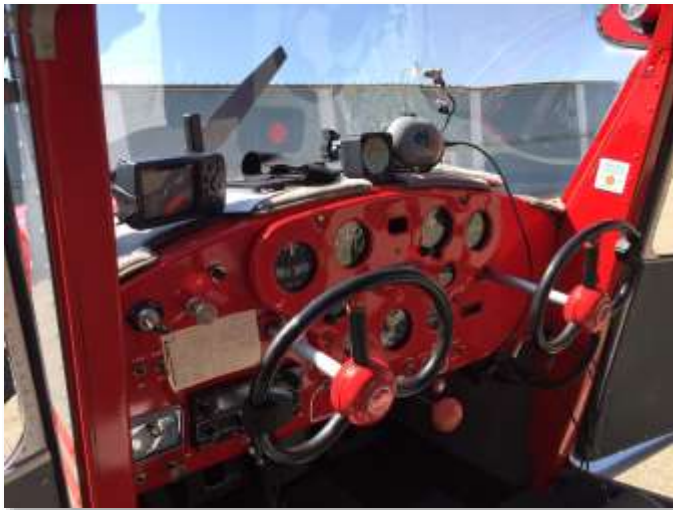
A beautiful panel in the sunshine. N77220. Andy Cotyk's 120