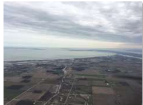
On approach to Port Clinton, stay well south of the Lake Erie shoreline.

get there the freighters that you will certainly see look amazing from altitude.