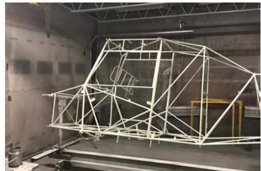
The freshly painted fuselage.