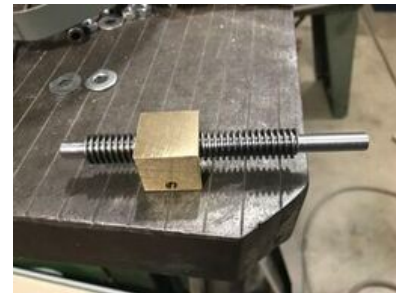
This is the jack screw for the adjustable seat

The work continues. Here are some recent photos: