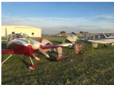
Camping at KMDH.