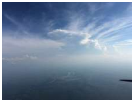
A storm builds in Central Illinois.

clearly see it. We tell the controller what we see and that we have already bent our course to the west. She tells us to let her know when we have resumed our course back to Carbondale, Illinois. We are VFR southbound at 8,500 feet and are headed to the Southern Illinois Airport, KMDH, to see the Great American Eclipse. The airport is in the “path of the totality”. Having observed this wonderful celestial event with my own two eyes, let me tell you, it is nothing short of astounding.