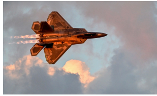
MOONRISE AFTER BURNERS

THERE ARE 3 SIMPLE THINGS THAT MAKE A SMOOTH LANDING. NOBODY KNOWS WHAT THEY ARE HOWEVER.