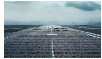
FAA UPDATES AC FOR PROCEDURES AT NON-TOWERED AIRPORTS