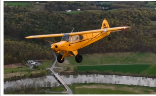
TRIPLE H EFFECT