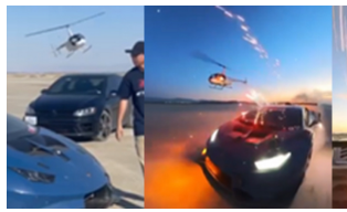
YOUTUBER ARRESTED AFTER HELICOPTER STUNT

“ IF YOU CHANGE THE WAY YOU LOOK AT THINGS, THE THINGS YOU LOOK AT CHANGE.”