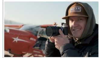
NEW BURDEN FOR BACKCOUNTRY PILOTS