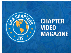
EAA CHAPTER VIDEO MAGAZINE APRIL