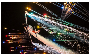
COUNTDOWN TO SUN'N'FUN

“THE PILOT WHO TEACHES HIMSELF HAS A FOOL FOR A STUDENT ”