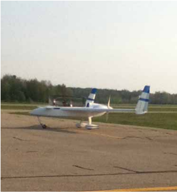
Paul arrives to the board meeting in style