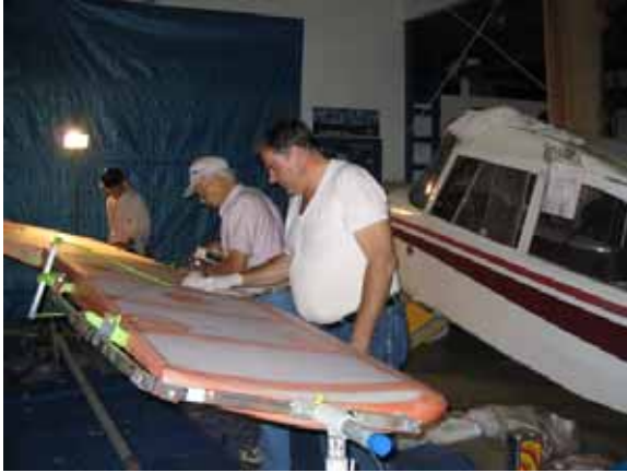
This months Mystery Plane is a project