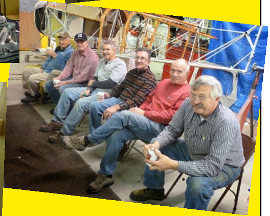
Clockwise from upper left: Painting the carburetor, Rebuilding the Magnetos, Shooting white undercoat on an aileron, Break time, Left wing being readied for paint, Nice firewall work!