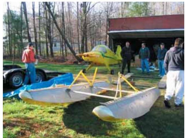
Cygnet and Floats