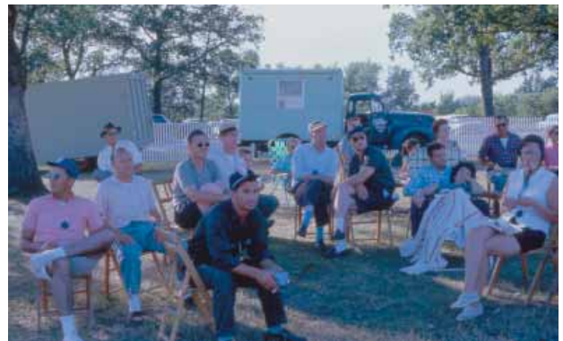
Rockford - 1963

The Cygnet built by Herb Kelley is still available. The Cygnet is a wooden two place plane powered by a VW type engine. It should qualify under Light Sport. The price has been reduced to $10,000. The plane is currently located in Zeeland. Contact Scott DeGaynor for more information. You can reach Scott at 616-437-7297.