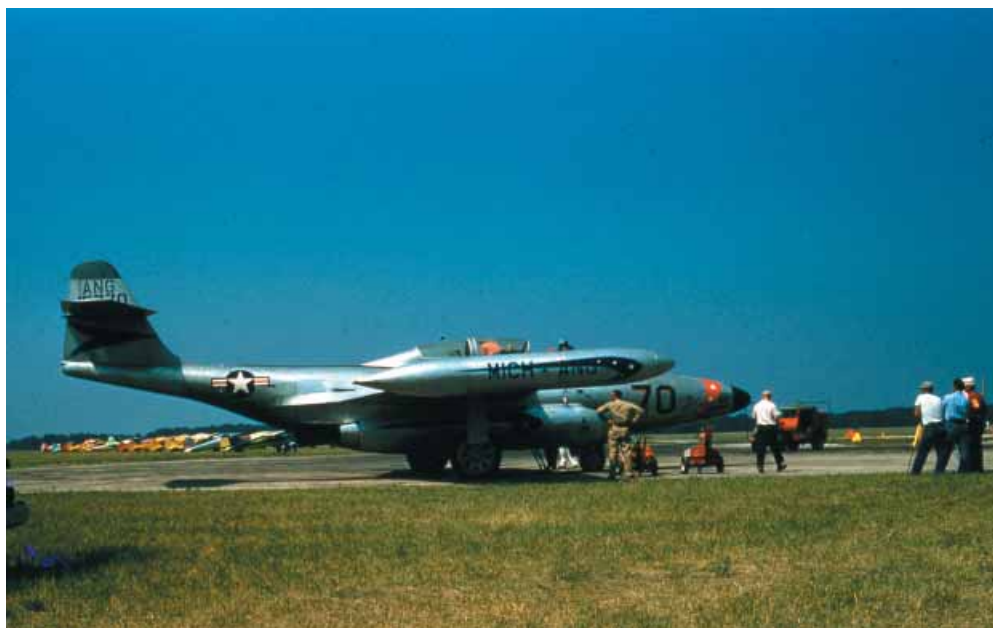
Muskegon Dawn Patrol, 1958