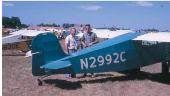
This months Mystery is Chapter plane at Rockford