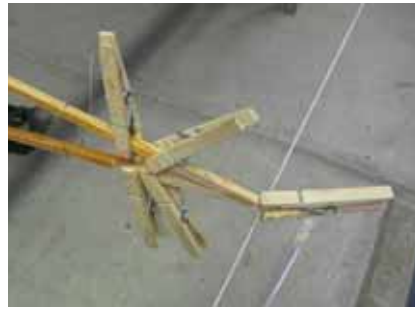
Last month's Mystery is a repaired rib on the Eaglet