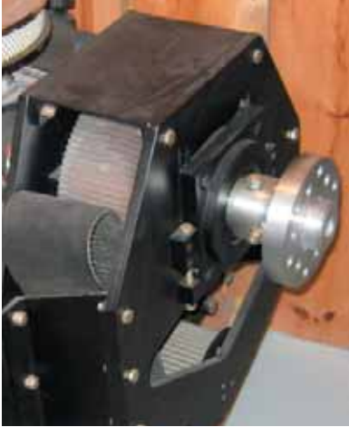
From a recent visit...