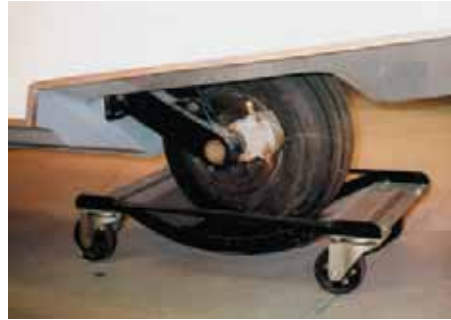
Last months mystery was the landing gear of the amphibian floats from the 2+2 that Bill Vandermolen is building