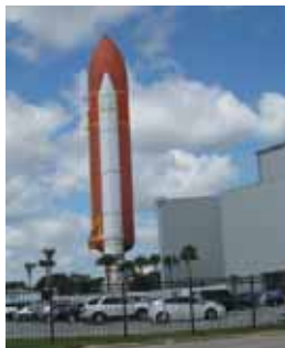
A over the fence mystery in Florida