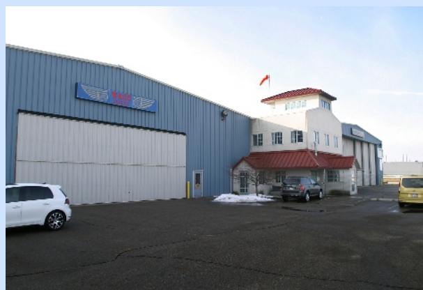
The WACO Classic Aircraft Factory