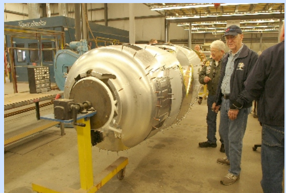
A WACO YMF-5D fuselage under construction. How sweet is that rotisserie!