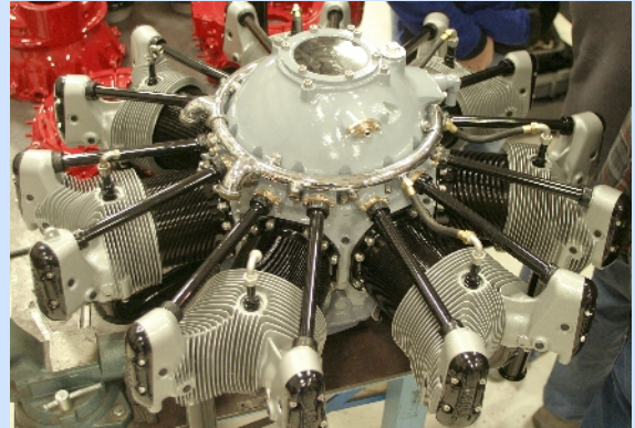
Jacobs radial engine - this one for display only!