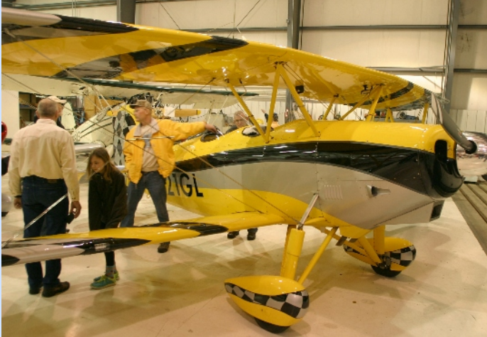
WACO Classic Aircraft also manufactures the fully aerobatic Great Lakes T2-A1 Bi-plane.