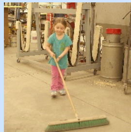
They start 'em off young and make 'em work their way up at the WACO Aircraft Factory!