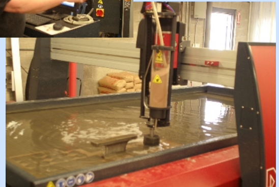
Dozens of intricate parts can be precisely and efficiently cut out on the company's new waterjet.