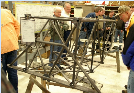
Precision welded, high-strength 4130 steel tube frame of a Great Lakes T2-A1.