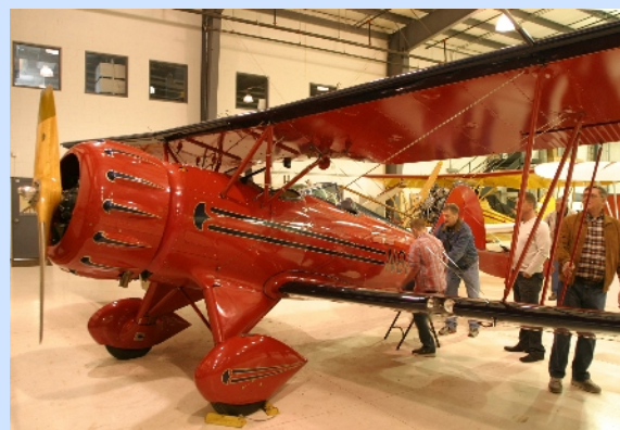
The beautiful, factory-owned WACO YMF-5D