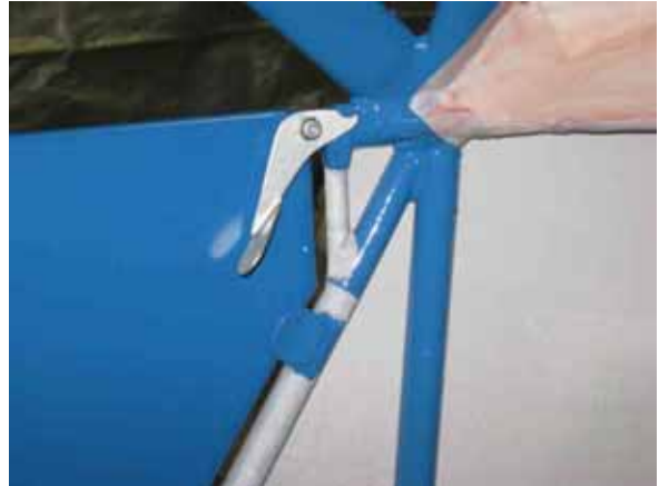
Last months Waco Mystery - the Eaglet door latch