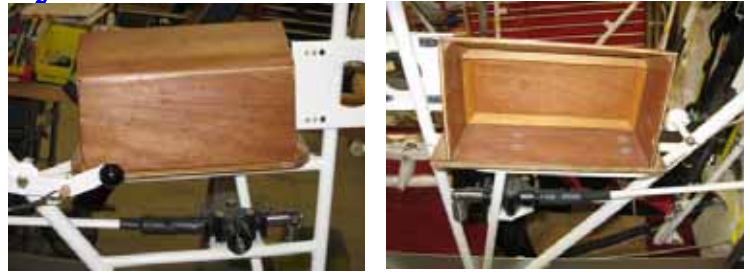
Last months Waco Mystery - the step to make it easier to climb into the cockpit