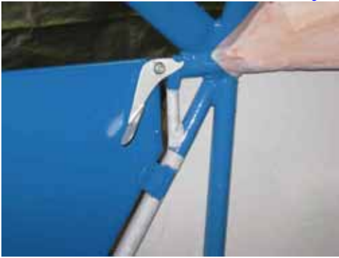
An Eaglet Mystery Part