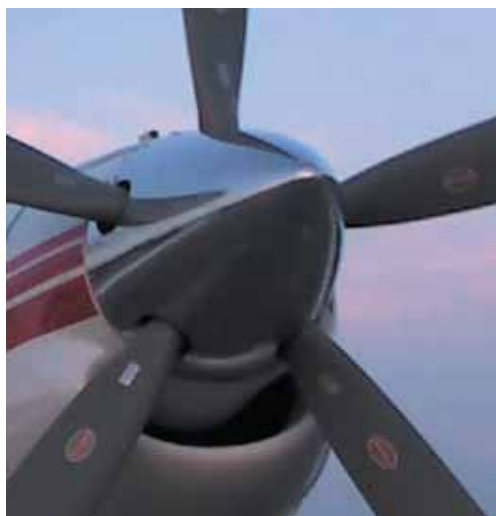
This month's Mystery Plane was a guest at Grand Haven