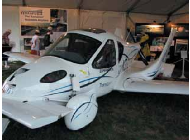
Last month's Mystery was the Terrafugia at Oshkosh