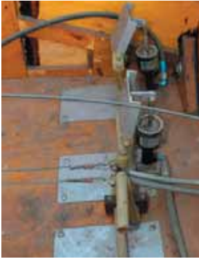
A garage Mystery