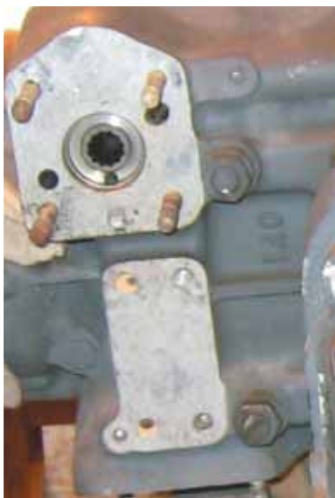
Mystery Engine Part