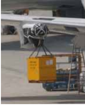
This months Mystery Plane was near Seattle