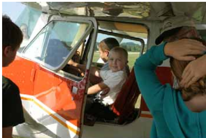
It's all about the smiles