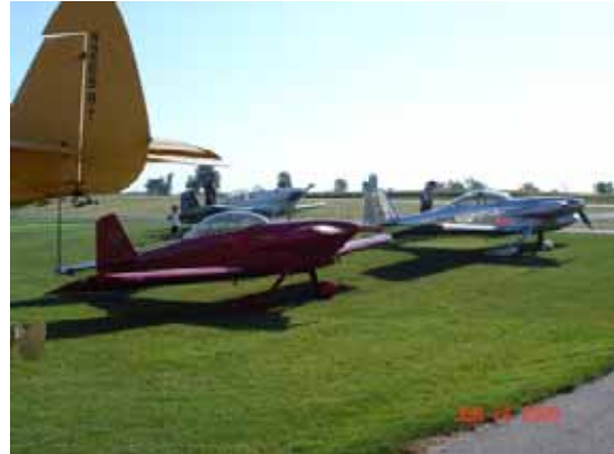
Last month's Mystery was RV's at a past Pancake Breakfast