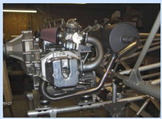
HKS 700 E engine