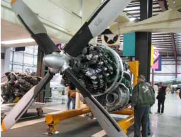
A Museum Mystery