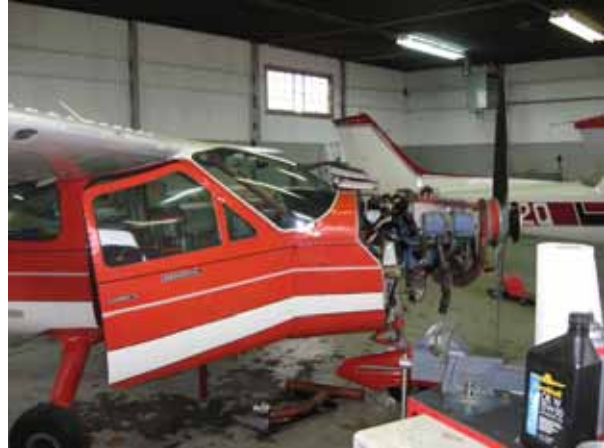
Last months Mystery - Craig's "new" Cardinal