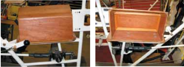
A Mystery from Waco