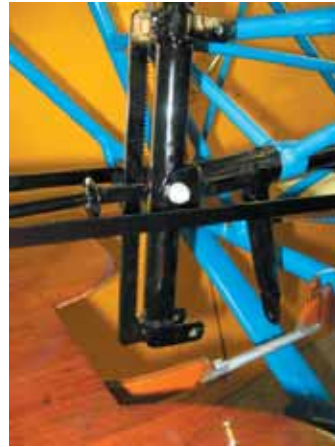
Eaglet Elevator Trim