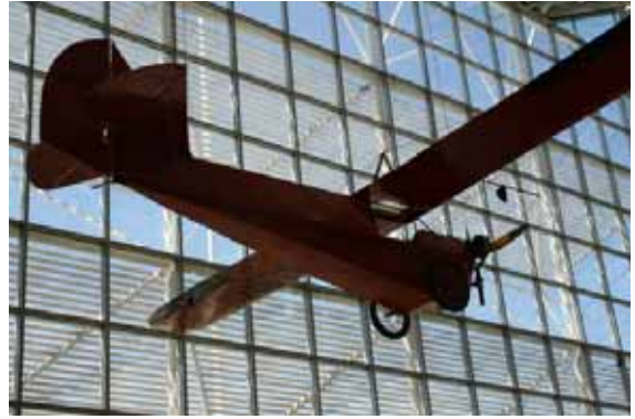
Last month's Mystery was an Aeronca C-3 at the Seattle Museum of Flight