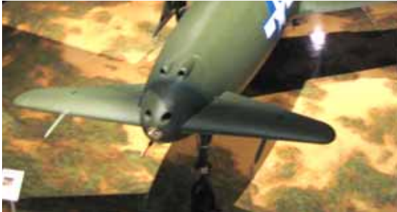
A Zoo Mystery