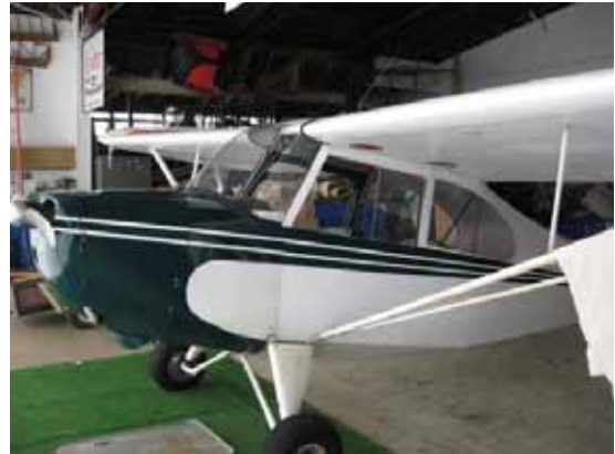
Last months Mystery - Gary's "new" Champ