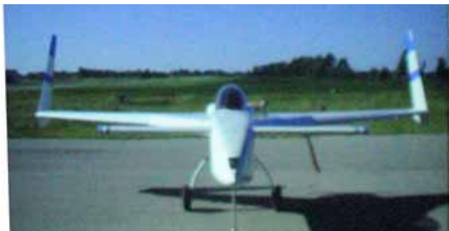
This months Mystery Plane was in the Newsletter 5 years ago