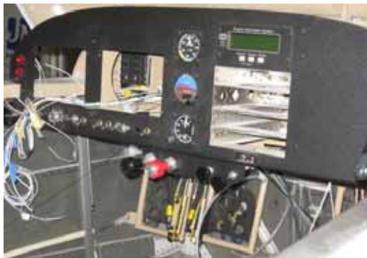
Last month's Mystery was the panel for Doug Forsma's RV