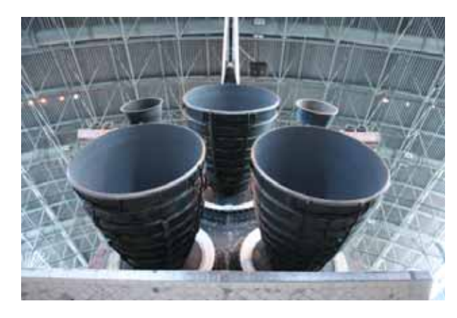
Last month's Mystery was the engines of Space Shuttle Discovery