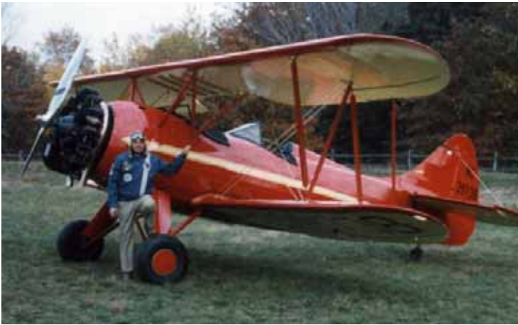
This months Mystery Plane was in the Newsletter 5 years ago